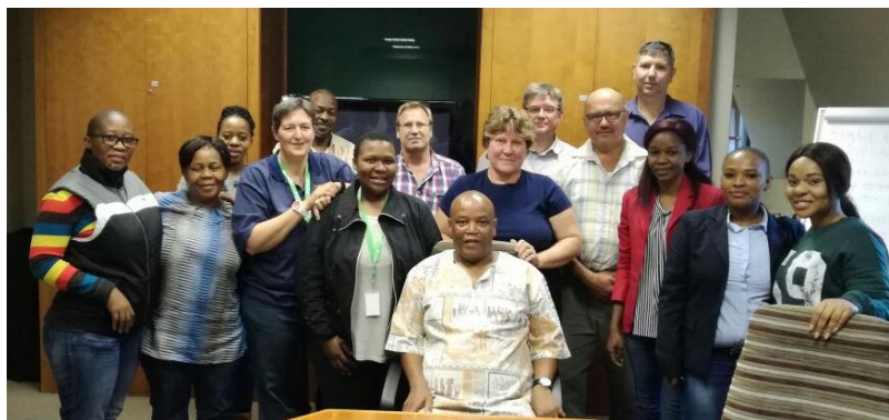
Members of the Incident Management Team’s ‘Factory Inspection team’ – taken at the Tshwane District Municipality offices 4 May 2018 after an inspection of one of the Enterprise factories.