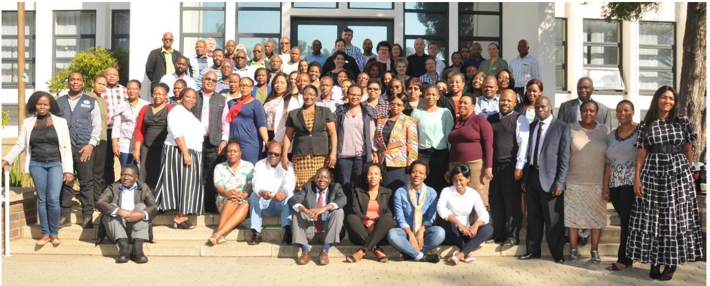
Attendees at the National Listeriosis workshop, held at the NICD 23-24 April 2018

Activities conducted by the IMT over the past three days include factory visits, ongoing surveillance and investigation of cases, motivations to obtain additional funding and preparations for the week commencing 7 May which includes factory visits and discussion of findings, training activities for EHPs and planning the provincial training schedule.