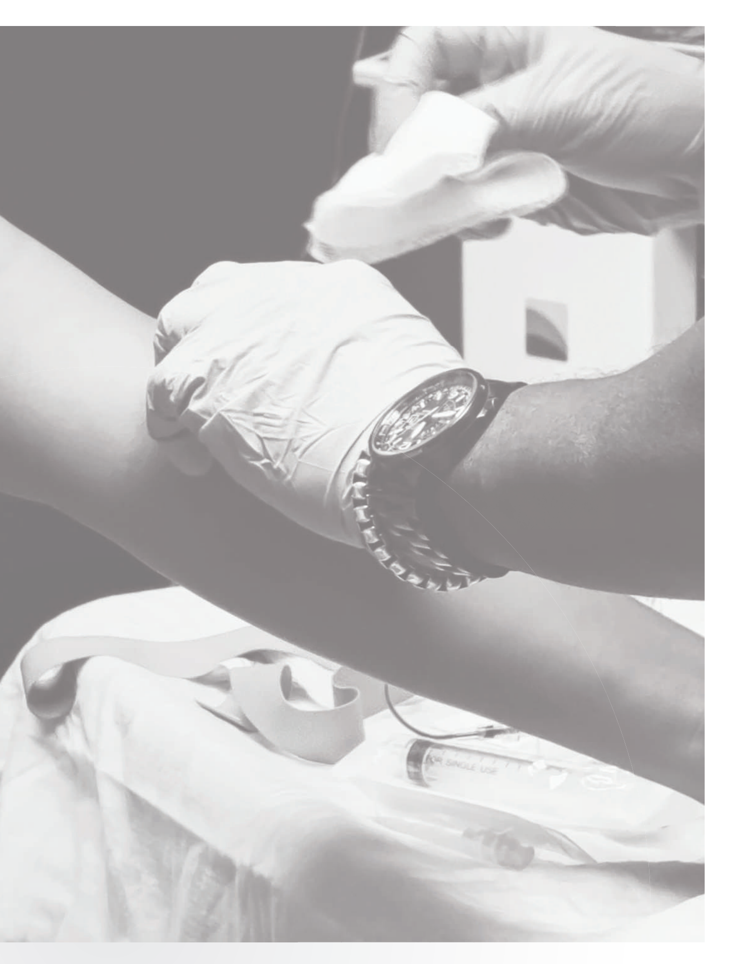
A ROAD MAP FOR STRENGTHENING NURSING AND MIDWIFERY IN SOUTH AFRICA (2020/21-2025/26)