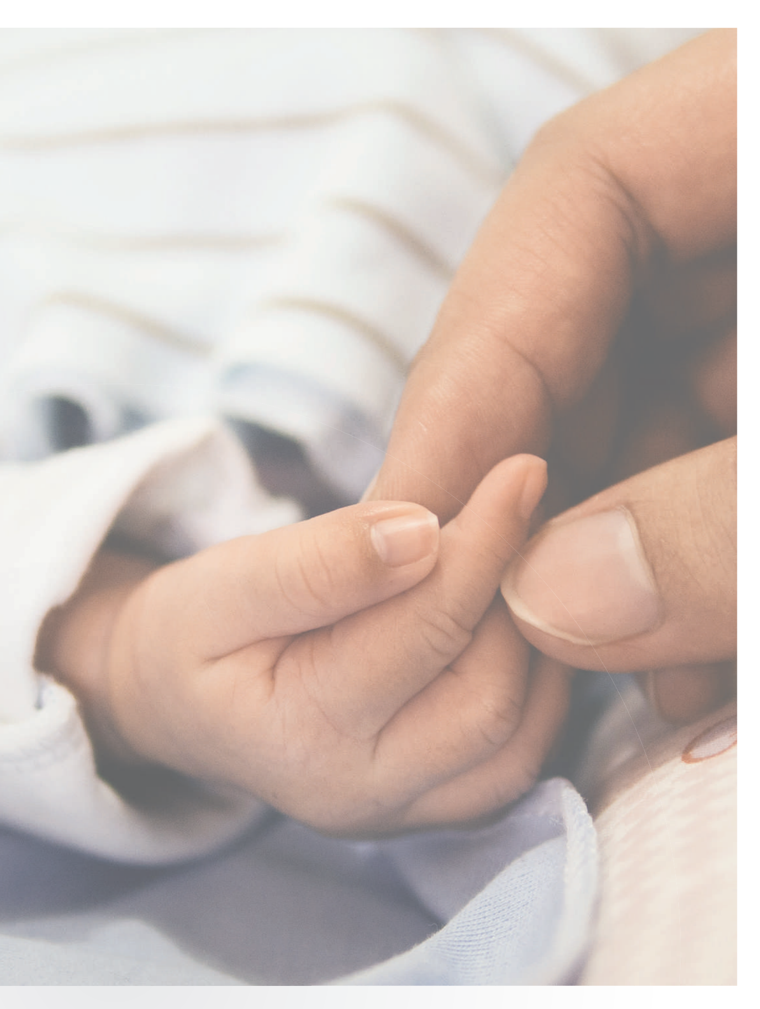
A ROAD MAP FOR STRENGTHENING NURSING AND MIDWIFERY IN SOUTH AFRICA (2020/21-2025/26)