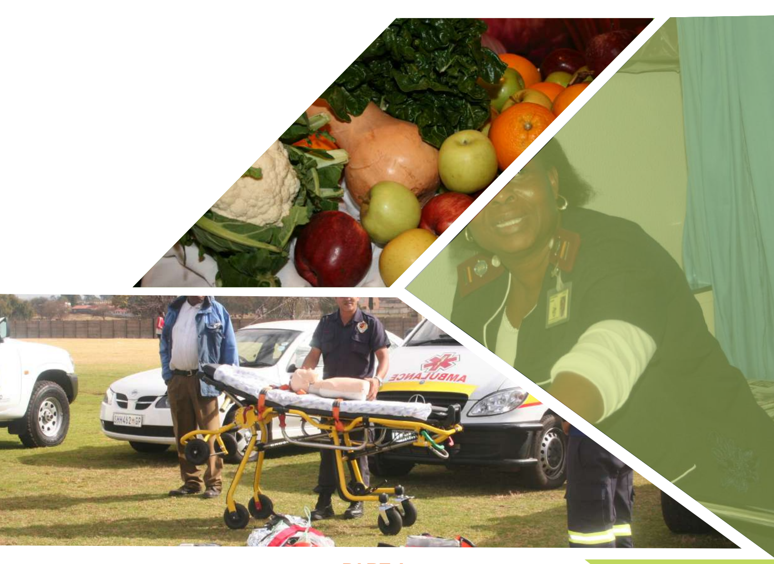
PART A GENERAL INFORMATION